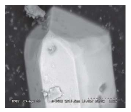
Figure 1: Scanning electron microscope photograph of a zircon.

Several of the major results of the RATE project (Radioisotopes and the Age of The Earth) involve the collection and analysis of small crystals called zircons. But, what are they and why are they so important? Mark Armitage, an ICR associate who has photographed zircons with his scanning electron microscope for RATE (figure 1), recently published an