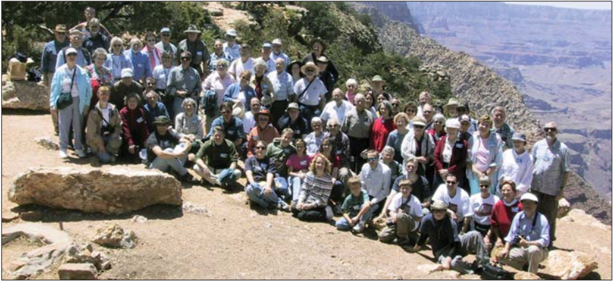
Grand Canyon 2004 Tour Group poses near the edge.

One hundred and eleven participants in the 2004 Grand Canyon Tour returned mostly unscathed from two weeks in the Canyon in May. Two groups of thirty rafters each challenged the upper and lower reaches of the Colorado River, ten hikers ventured into Havasupai Canyon, and forty-five intrepid bus participants explored Grand Canyon and the surrounding Parks.