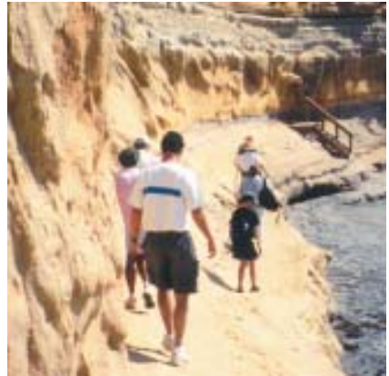
Beach Trail Finale.

Old earth thinking places these geological layers at 45 million years, but the facts of geologic deposition, tectonics, and species distribution point to a different interpretation. The sandstone, debris flows, and large-scale, water-caused