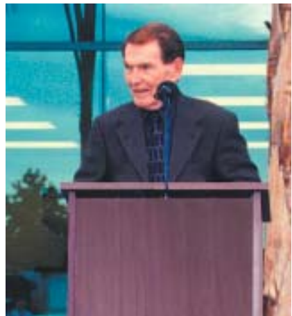
Dr. Tim LaHaye at ICR's 35th Anniversary celebration and building dedication.