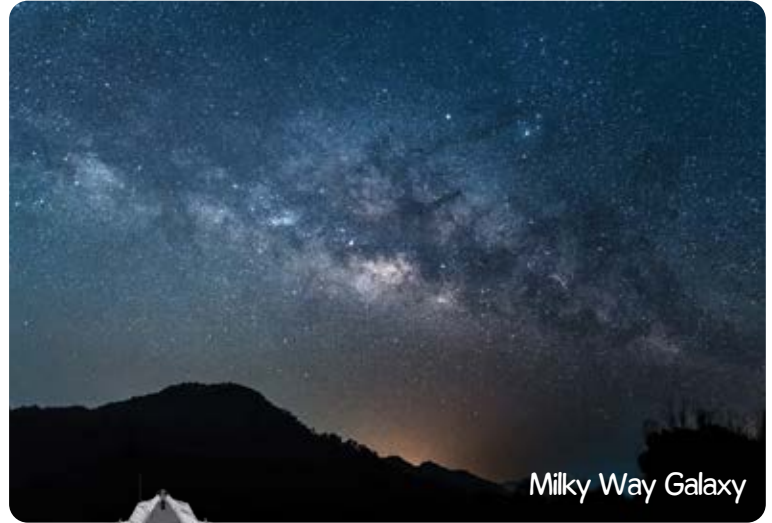
Milky Way Galaxy