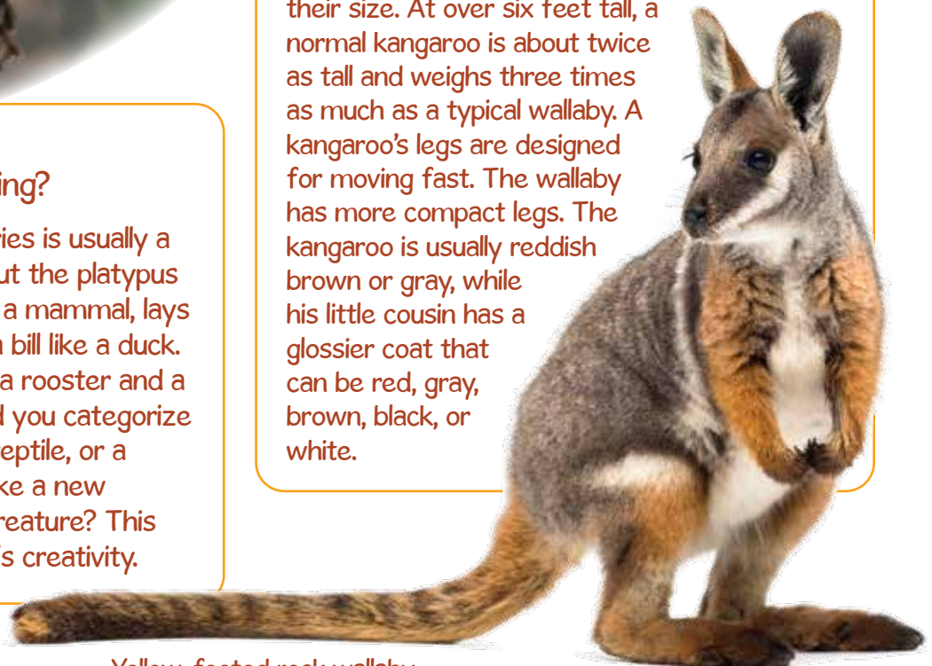
Yellow-footed rock wallaby

They are both marsupials, bounce as they run, and live in Australia. The biggest difference is their size. At over six feet tall, a normal kangaroo is about twice as tall and weighs three times as much as a typical wallaby. A kangaroo's legs are designed for moving fast. The wallaby has more compact legs. The kangaroo is usually reddish brown or gray, while his little cousin has a glossier coat that can be red, gray, brown, black, or white.