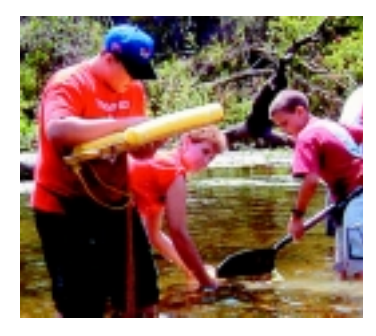
Children at camp.

Exciting and educational "creation adventures" are now available for residents and visitors to fabulous southern Florida. Hands-on workshops, fossil digs, fossilhunting canoe trips, and overnight campouts are offered to church, school, and home school groups by the "Creation Adventures Museum," which also conducts three-day and week-long family camps and church retreats plus courses for college and CEU credits, especially during the spring break season. Longer adventures include trips to the beach and Everglades and snorkeling/diving in the Florida Keys! All programs explore the wonders of God's world in the light of God's Word