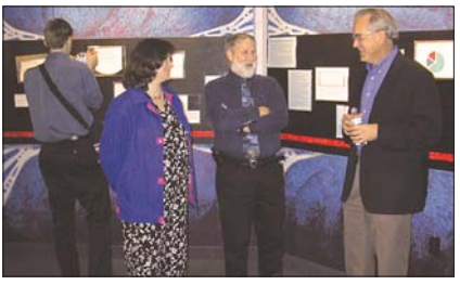
Museum visitors in the new genome room.

This has become so much of a "problem" that the American Association for the Advancement of Science has started holding seminars for teachers to "give them tools to respond when students, parents or local officials pressure them to avoid teaching evolution or to introduce the faith-based concepts of intelligent design or creation-