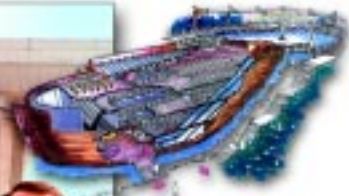
John Morris at site dedication for the Rainbow Paradise.

Noah's Ark and Noah's Flood have always been favorite children's stories, but adults remain fascinated with factual possibilities as well. Every bit of news commands headlines in the media. Sometimes the reports contain bogus information, but intriguing facts continue to captivate.