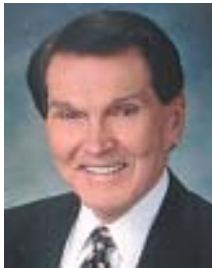
Dr. Tim LaHaye