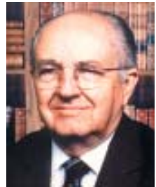
Dr. Henry Morris

Pastor Chuck Smith, Dr. Tim LaHaye, Dr. Duane Gish, and Dr. Henry Morris are teaming up for one of the most momentous events since the modern creation movement began over 30 years ago. Passing the Torch of Creation is scheduled for Saturday, May 18, 2002, at Calvary Chapel of Costa Mesa, at 3800 South Fairview Road in Santa Ana, California.