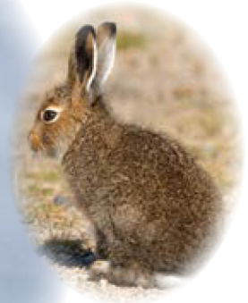
Arctic hare in his winter coat (left) and his shorter summer coat (right)